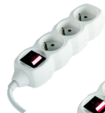
LUNGA S3 3G1.0X1.4M