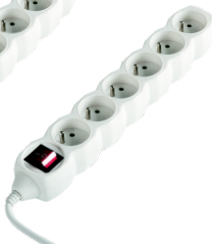
LUNGA S6 3G1.0X1.4M