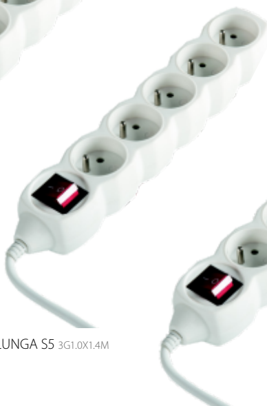
LUNGA S5 3G1.0X1.4M