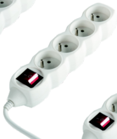
LUNGA S4 3G1.0X1.4M